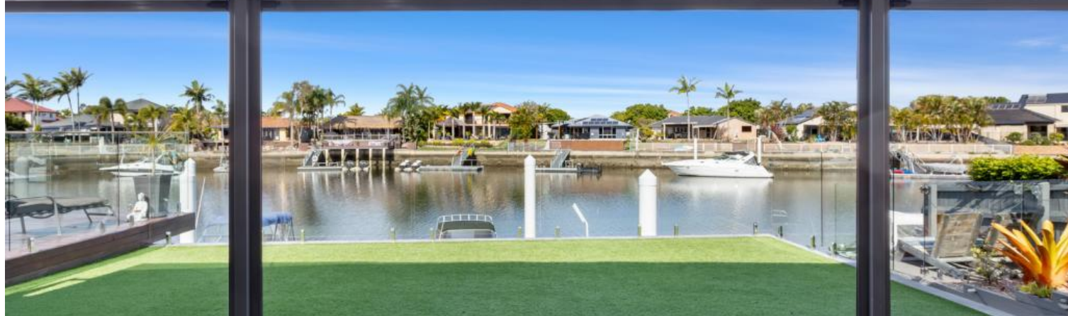
2, 19 Bowsprit Crescent, Banksia Beach